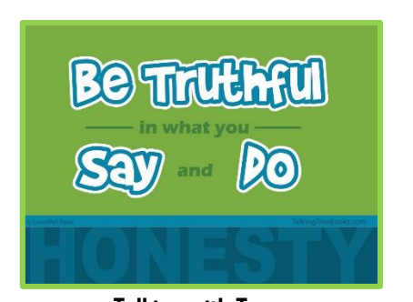
Talking with Trees Talking with Trees books and teaching resources help elementary school aged children learn good character traits and social skills. <a href="https://talkingtreebooks.com/teaching-resources-catalog/quotes/quote-honesty-trustworthiness-series.html">https://talkingtreebooks.com/teaching-resources</a> catalog/quotes/quote-honesty-trustworthiness-series.html